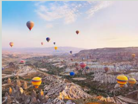
7. Cappadocia, Turkey