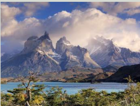
3. Torres del Paine National Park, Chile