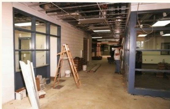
Inside of Front Doors. Guidance to the Left and Front Office to the Left