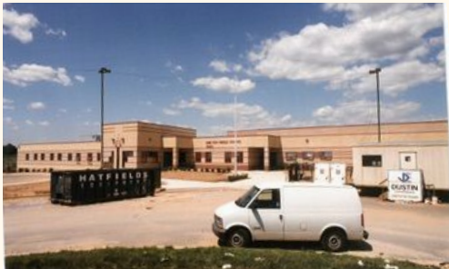
Front of Lime Kiln: Spring of 1999