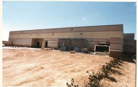
Back of the building